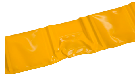
The keel pocket can receive displaced air when the boom is stowed for compact storage